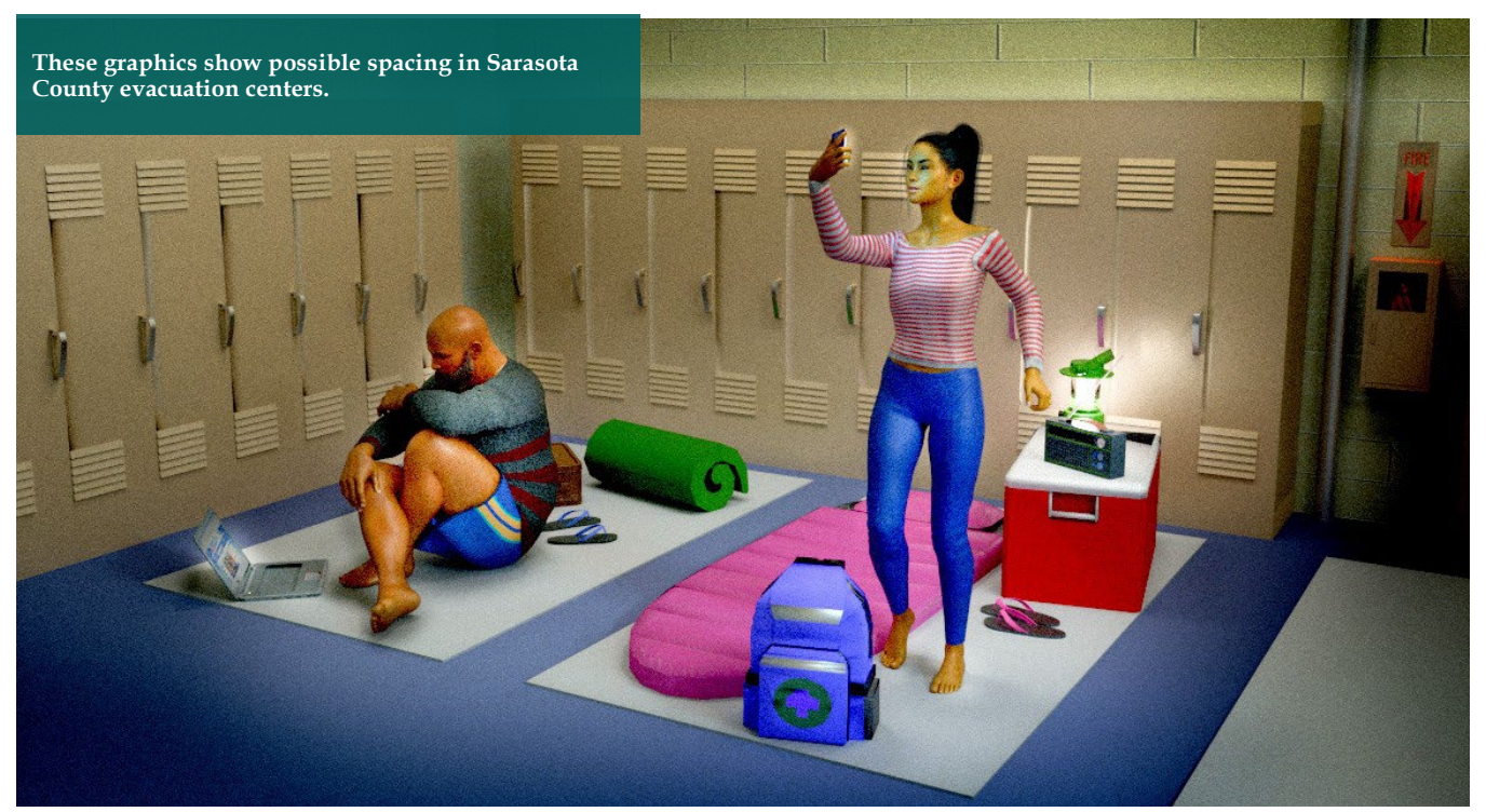
* Floor mats represent the space available. Floor mats will not be provided.